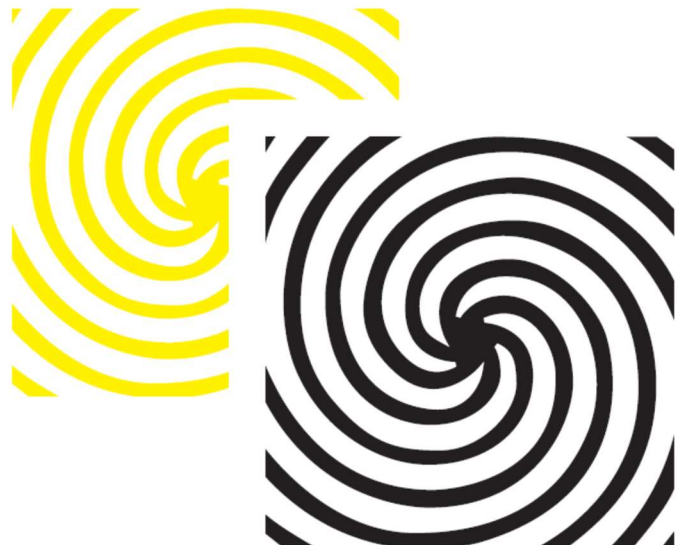
INTERNAL SHEET FRONT / BEFORE (YELLOW) AND AFTER THE PROCESS (BLACK)

This document is property of E.C.S. s.r.l. and the information herein contained are for industrial purposes only. Any unauthorized copy scanning, different use or publication of this document without prior consent is strictly prohibited. Any improper use will be prosecuted by law.